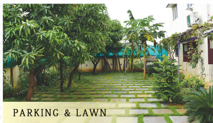
PARKING & LAWN

Species rich garden with pleasant study environment along with well spacious parking